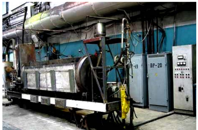
Fig.2 Pilot plant to produce rare-earth elements, molybdenum trioxide, calcium molybdate and to make full utilization of sulfur dioxide

(Fig.2). It is employed at a pilot plant producing rare earth elements, molybdenum trioxide, and calcium molybdate, with complete utilization of sulfur dioxide. Trial batches of molybdenum trioxide have been supplied to steel plants.