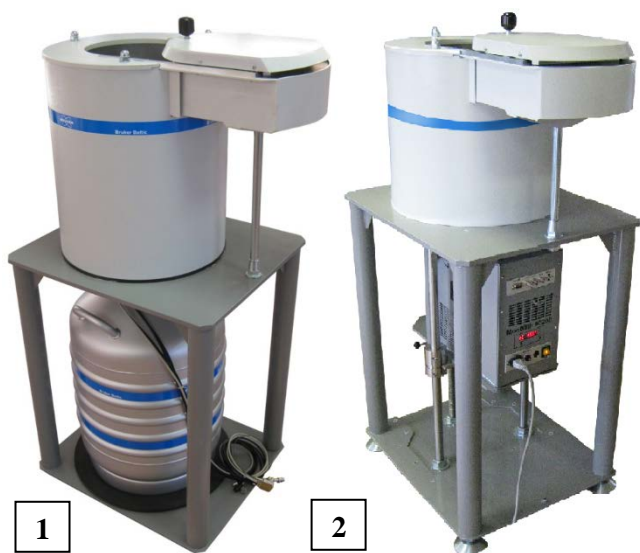
Fig.1. Laboratory HPGe gamma-spectrometer with shield: 1 - with liquid nitrogen cooling and 2 - with cooling system based on Stirling electrical cooler LSF9340-02 (Thales, France).

Stirling electrical coolers of different cooling power allow to design modern precise spectrometric equipment with innovative cooling systems without liquid nitrogen. At the beginning in development we design Solidworks computer general model and then make a full detailing.