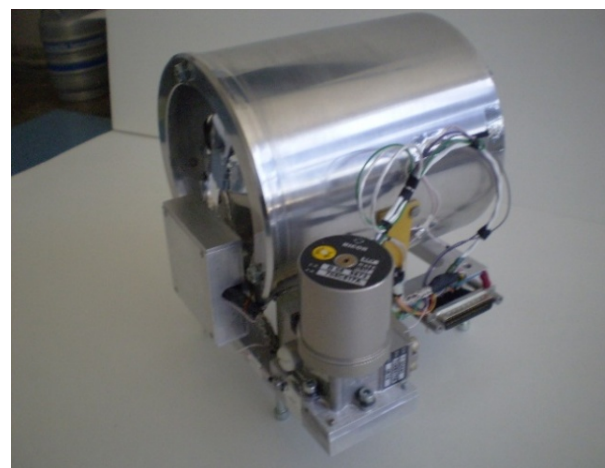
Fig.3. Miniature HPGe gamma-spectrometer for space applications

Fig.2. presents portable HPGe gamma-spectrometer for field applications - analysis of the radionuclide pollutions on the nuclear enterprises, at the environment monitoring and inspections on the border. The spectrometer has a complicated cooling system for HPGe detector based on Stirling electric cooler SL-400 (AiM, Germany) with cooling power 4W at the temperature 80K [8]. Weight and overall parameters of the spectrometer has important value for portable device and its inner assembly has been modeled several times to get the optimization. The optimization has been carried by Solidworks Professional + attachment Solidworks Simulation (machine dynamics for strength, stability, deformation systems dynamics, thermo elasticity). The weight of spectrometer is 12 kg. Energy resolution of spectrometer is less than 1.0 and 2.0 keV on energies 122 and 1332 keV correspondingly. Worsening of energy resolution of spectrometer, compare to equipment with liquid nitrogen cooling, generated by acoustic vibration of Stirling electric cooler.