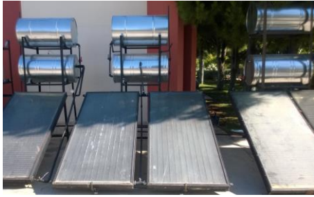
Fig. 3 Collector overview

In order to compare the three systems in an objective way, these systems were run under the same operating conditions and the results were compared and examined in detail. Temperature measurements were made within the scope of the study. A temperature data logger is placed at the inlet and outlet of the collector to determine the temperature change in the collectors. By means of these data loggers, how much the fluid circulating in the collector has been measured. Measurements start at 8:00 in the morning and finish at 8:30 in the evening. The measurement range is set to 30 minutes.