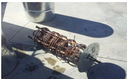
Fig. 5 Heat exchanger overview