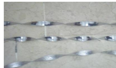
Fig. 1 Aluminum Bars

For both long and short collector systems in horizontal tubes, 52 pipes and 3 mm thick aluminum bars were bent. Bent aluminum rods are shown in Figure 1.