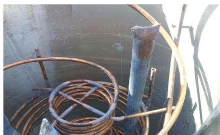
Fig. 6 Heat exchanger in tank