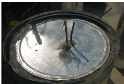
Fig. 4 Tank overview

The general view of the collector hot water tank and heat exchanger is given in detail in figure 4, 5 and 6.